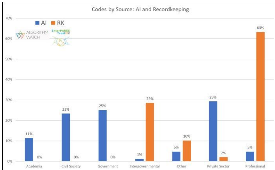
Codes by Source

Core archival values, such as the value of authentic records, will likely remain constant. For example, the accountability principle described by the IEEE’s «Ethically Aligned Design» states: «Systems for registration and record-keeping should be established so that it is always possible to find out who is legally responsible for a particular A/IS [autonomous and intelligent systems].» But fulfilling such a requirement will be challenging when «it’s not always clear when an AI system has been implemented in a given context, and for what task.»