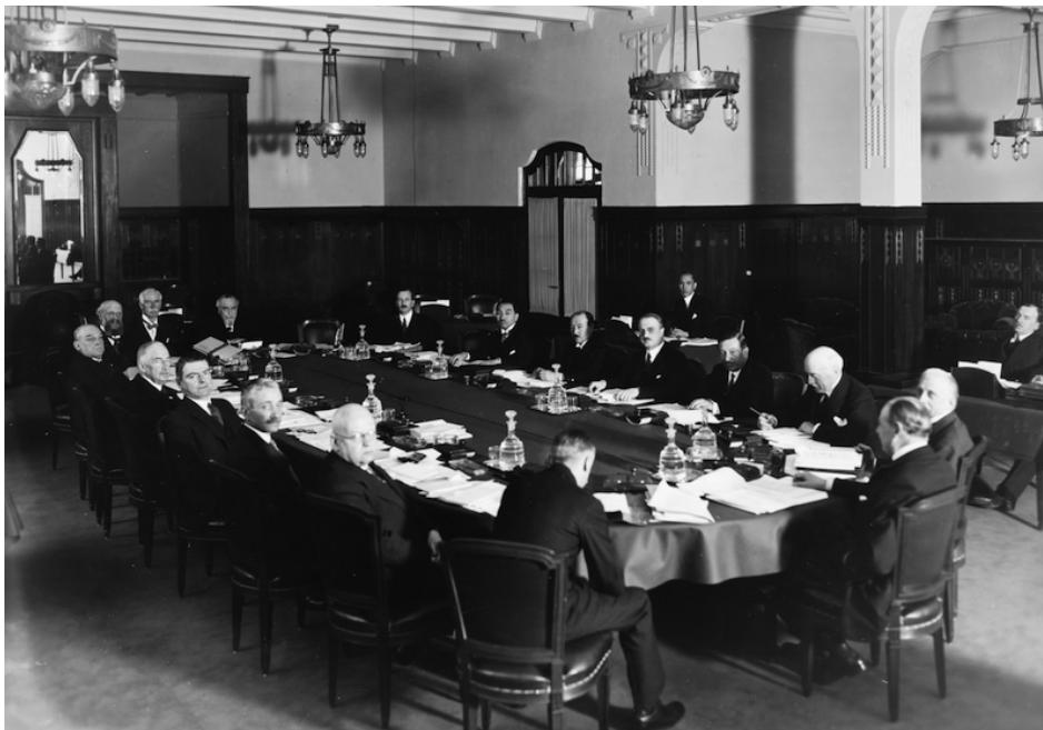
The unofficial first board meeting of the Bank for International Settlements in April 1930. (BISA.7.27.2.PEO.4.Historical.photos.125)

Currently, access to the BIS Archives is only on-site, meaning external researchers have the privilege of consulting original files. We are currently working on digitising selected files and making our most popular collections available remotely to enable access to our material for more researchers.