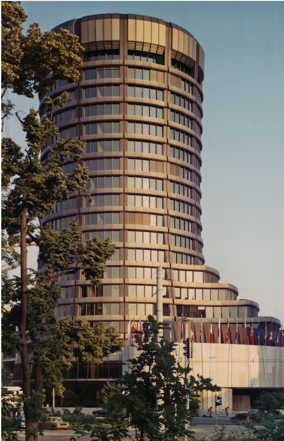
The BIS tower building in Basel, photographed 1978, a year after its completion. (BISA.7.27.1.BUI.2.Historical.photos.046)